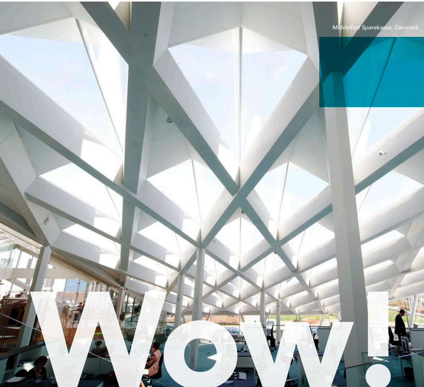
Middelfart Sparekasse, Denmark